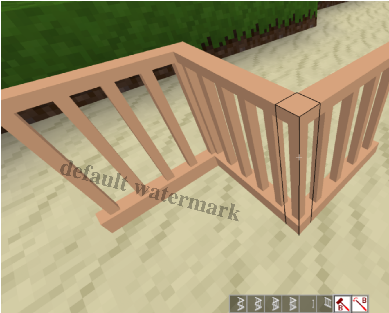
Front (5-column), corner (5-column) and corner-point variant